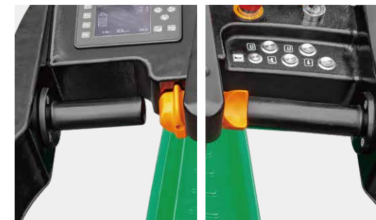
Right and left hand sensing