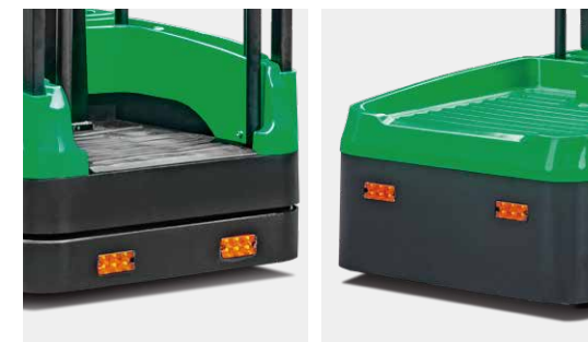
Front and rear flashing lights